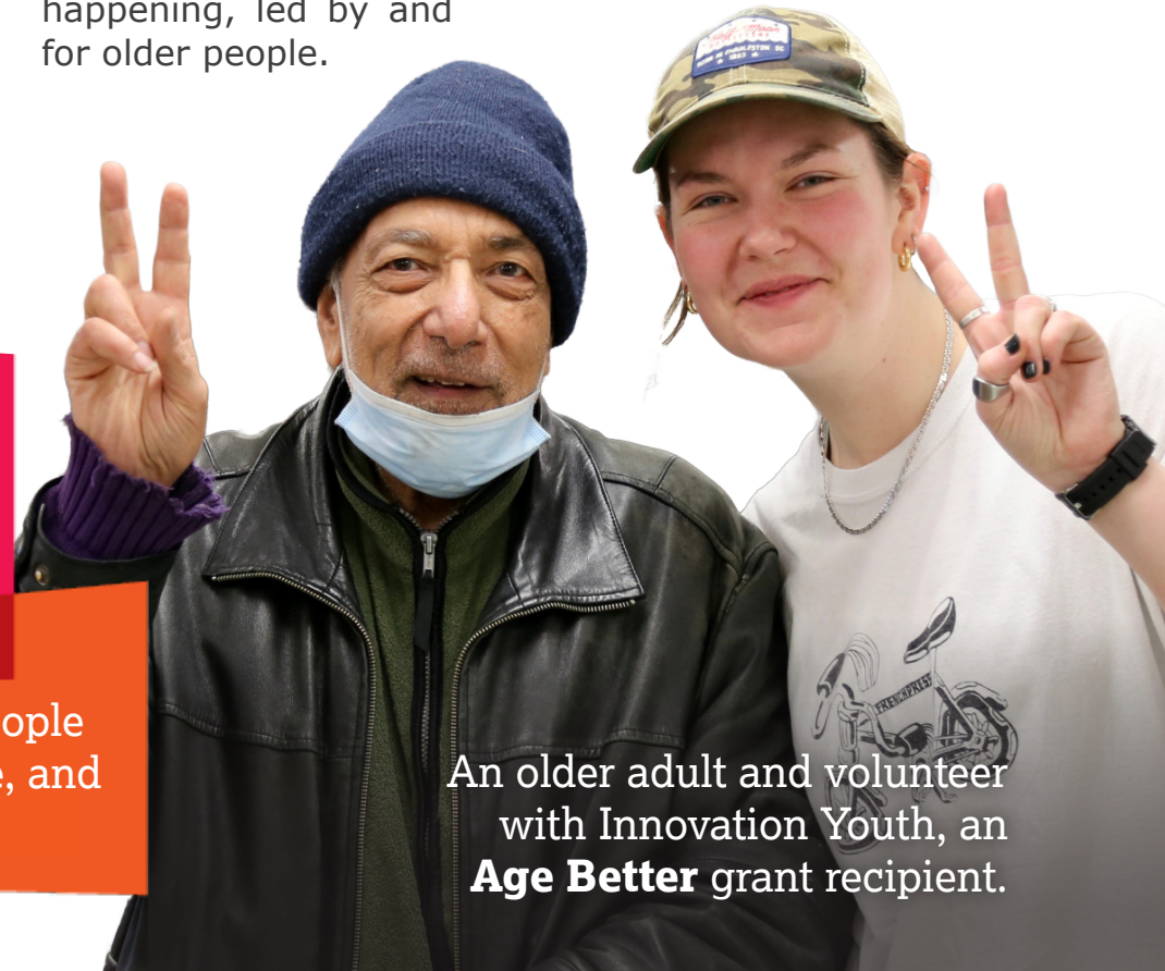
An older adult and volunteer with Innovation Youth, an Age Better grant recipient.

Amplifying voices of older people by participating in anti-ageism initiatives, humanitarian action groups, and advocating where important conversations are happening, led by and for older people.