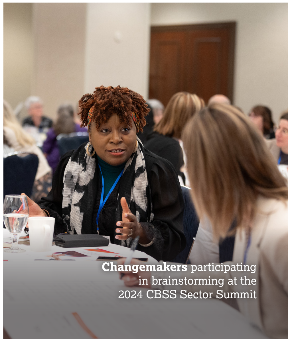
Changemakers participating in brainstorming at the 2024 CBSS Sector Summit