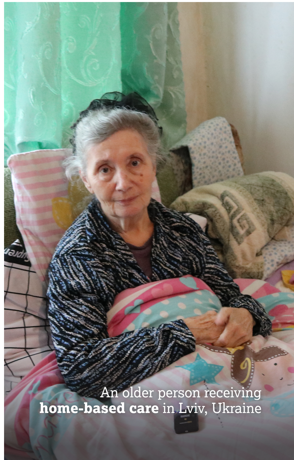
An older person receiving home-based care in Lviv, Ukraine

HelpAge has been operating in Ukraine since November 2014 when conflict broke out in the east of the country. More than four million people have been directly affected by the conflict , with a disproportionate number of those being older people.